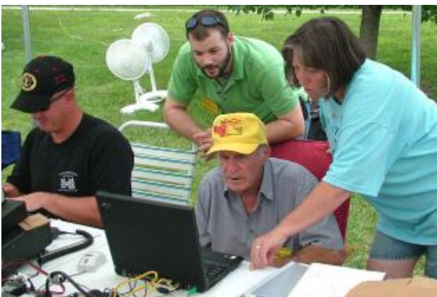
Hands-on Logging Instruction

Shelby Hamfest — We have been informed of the following by organizers of the Shelby Hamfest: