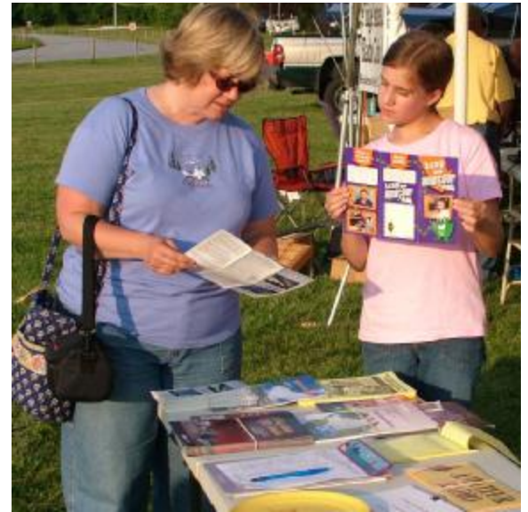
Visitors Sign In

Room for improvement? You bet! At the July meeting members made several suggestions: