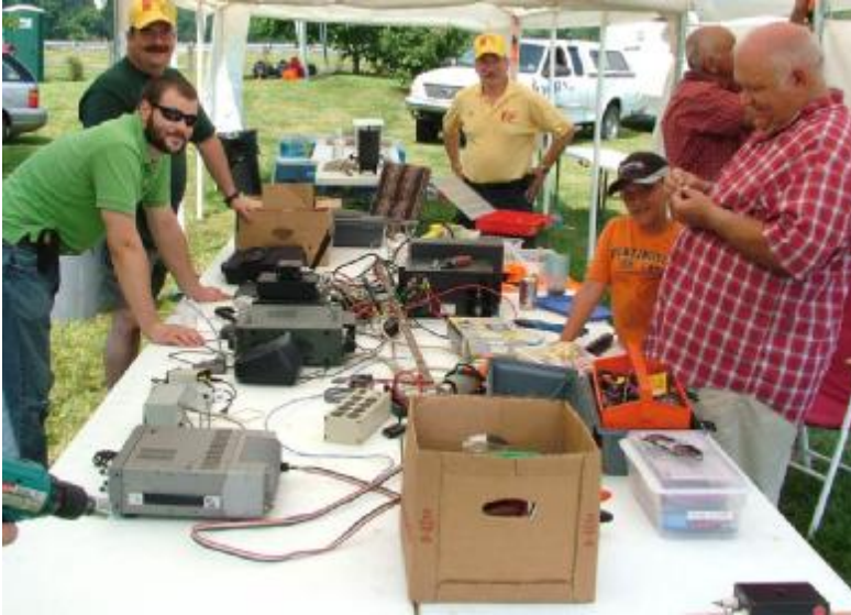
Setting up the Rigs

Our score was 3,456. This noses out our previous 5-year record of 3,438 set in 2006. Best of all, we set a record for attendance – 55 participants. And the weather was fine!